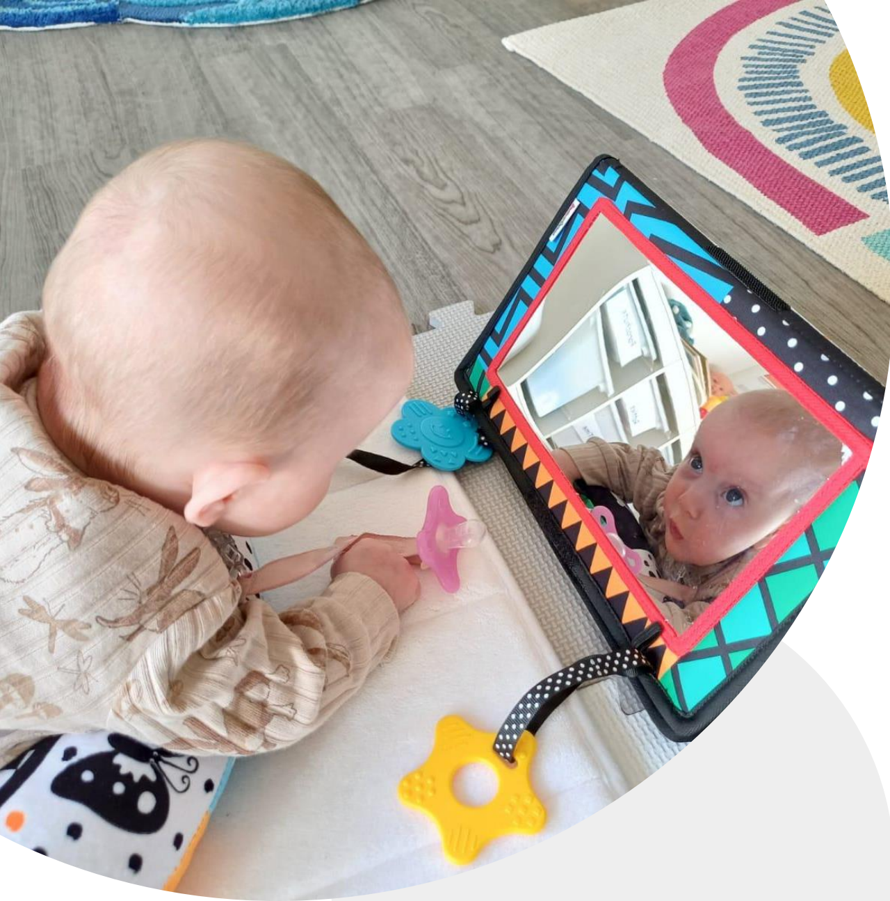
[Baby "E" enjoying some tummy time]