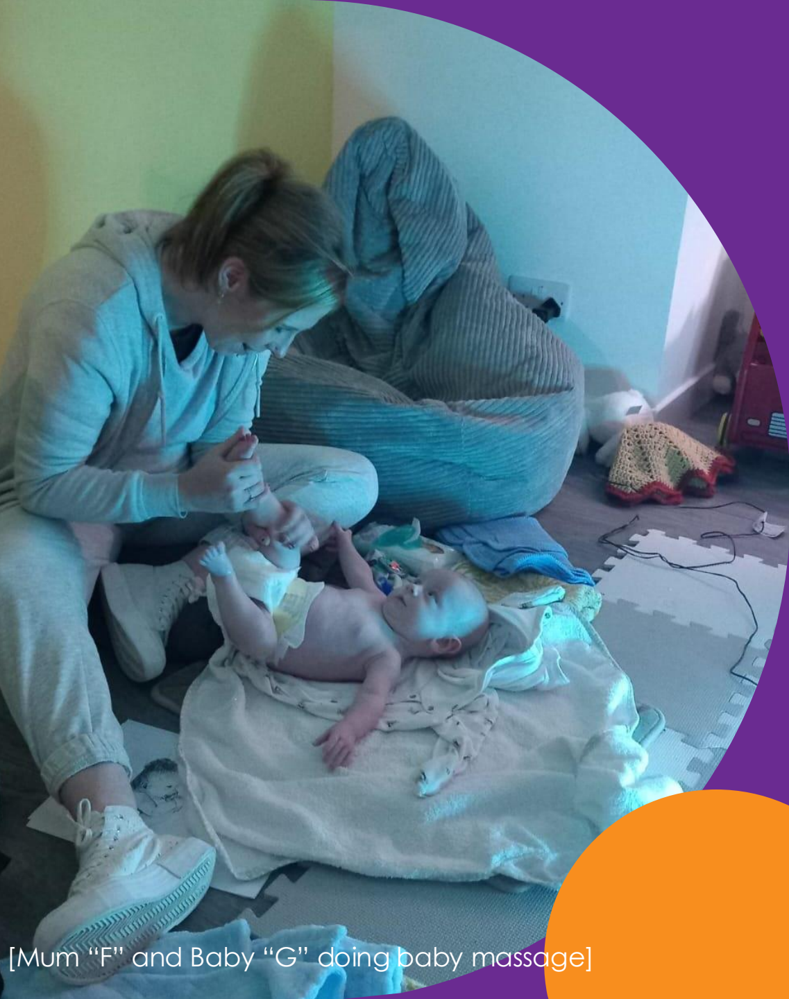
[Mum "F" and Baby "G" doing baby massage]