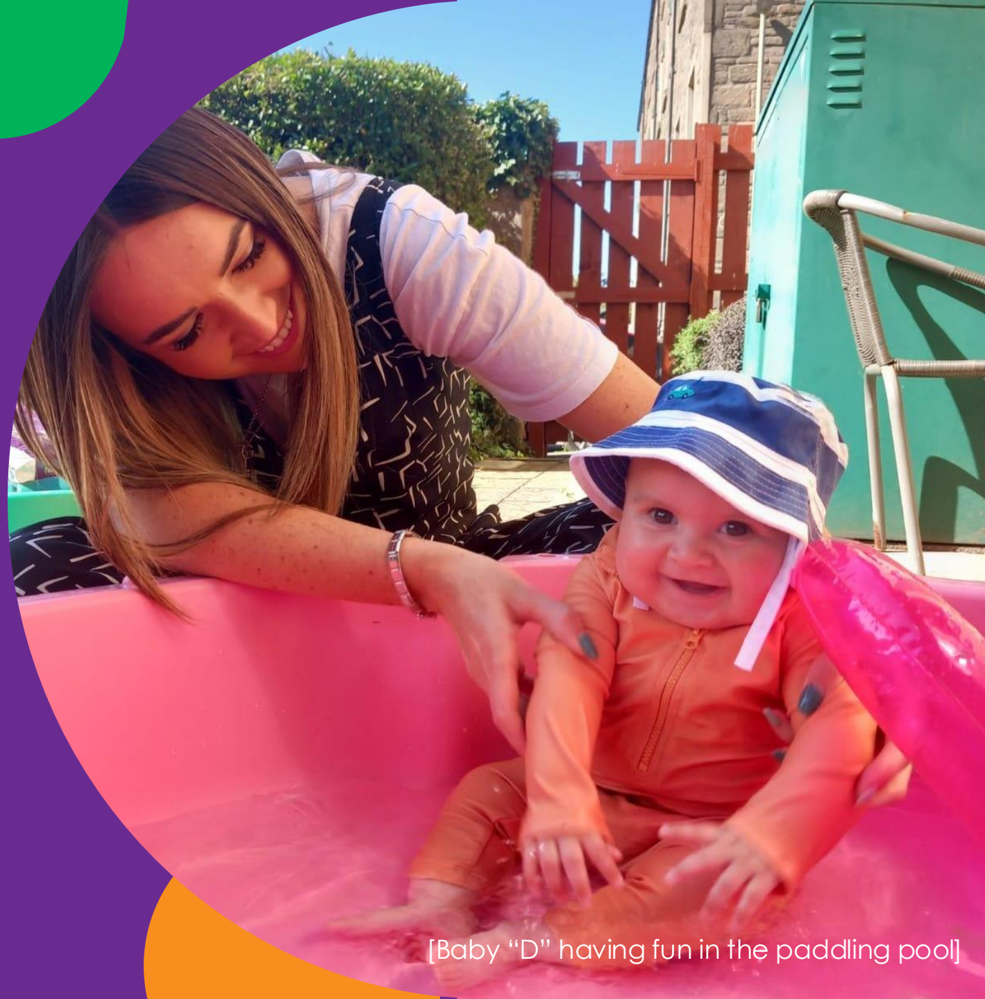
[Baby "D" having fun in the paddling pool]